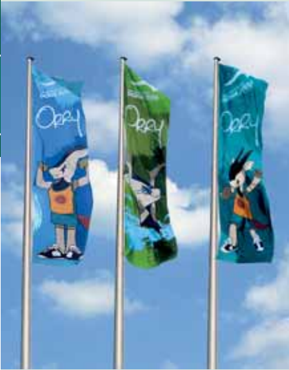
▲ Advertising Flags