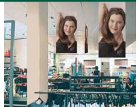
▲ Indoor Banners

Gladly, we will introduce our "Twiny®" banner to you, a double sided positive reading banner for indoor use.