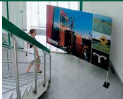
▲ Q-Frame® CS100