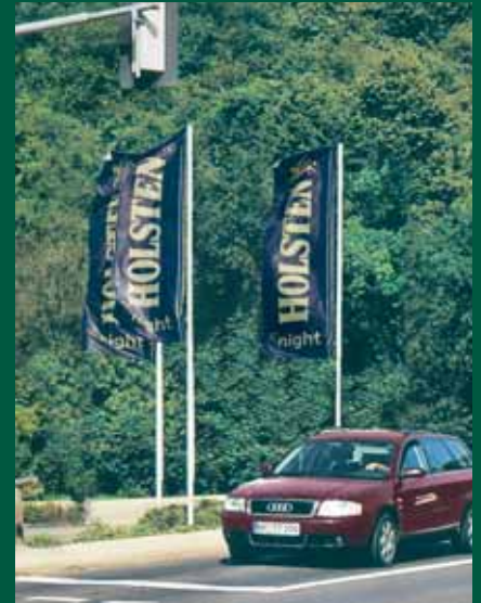
▲ Reverse Side