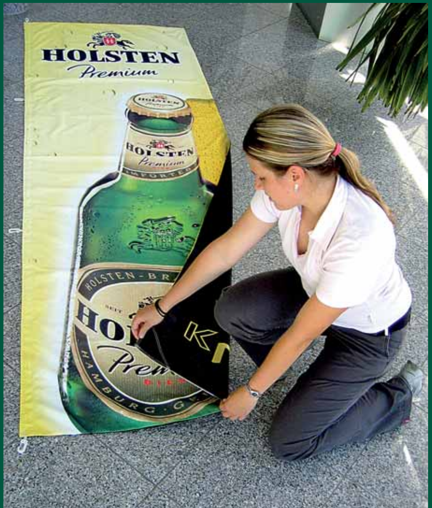
▲ Double sided flag with different designs on front and reverse side