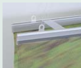
Plastic clamping rail