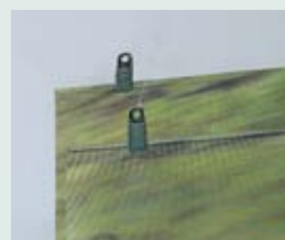
Glued-in metal rod with metal clip