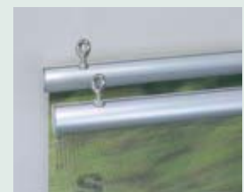
Aluminium profile with eye screw

As we are continuously developing our products we reserve the right of changing technical issues and dimensional deviations.