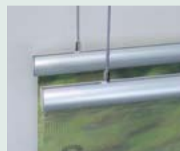
Aluminium profile with sliding block, steel rope included