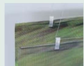
Glued-in metal rod with plastic clip